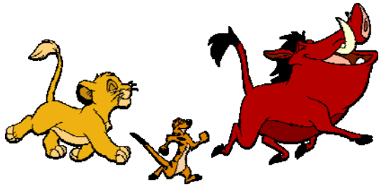
The Lion King