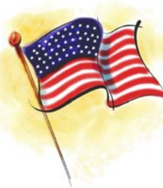
Band of Brothers